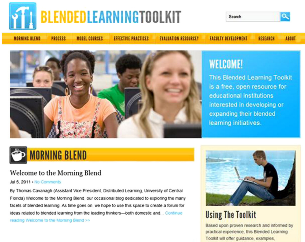
Fig. 2. Blended Learning Toolkit front page.

provide valuable information in terms of how to scale blended learning to many campuses and present lessons learned on a variety of issues, challenges and successes that come from a rapid dissemination of ideas.