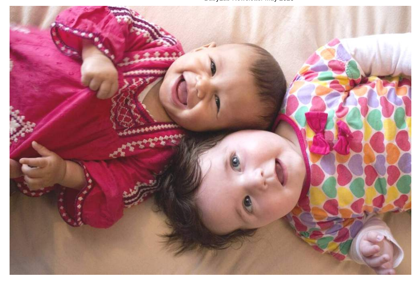
<u>Instagram</u> | <u>Facebook</u>

For enquiries: <u>babylab@westernsydney.edu.au</u>