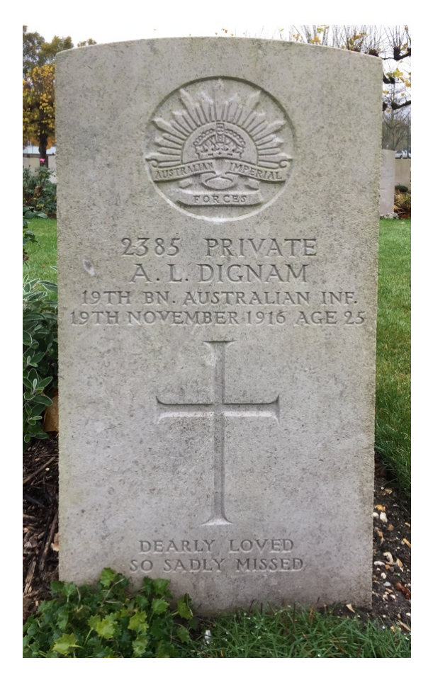
St Sever Cemetery Extension, Rouen Photograph \ensuremath{\mathbb{C}} John Knight 15 November 2016