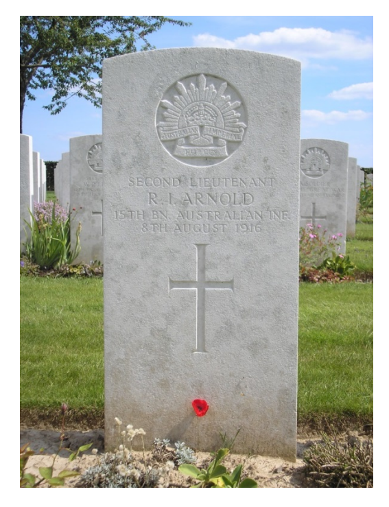
London Cemetery and Extension, Longueval, France. Photograph \ensuremath{\mathbb{C}} P.R. Lister 20 June 2014