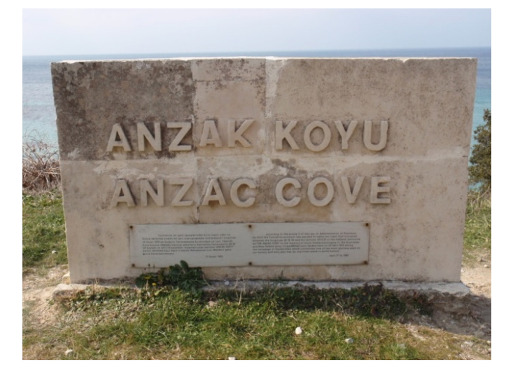
ANZAC Cove Turkey

Front Row: A. Lloyd, A.M. Garbett AI-49219HAC Journal (Vol.VIII, No.1) December 1910 p.179