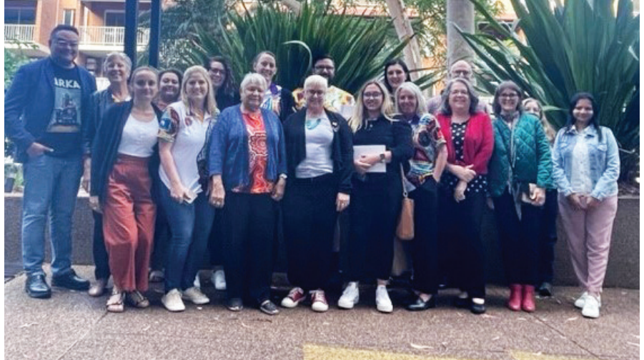
Watch Inflate Team