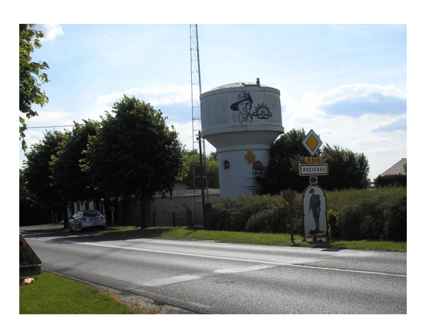
Signage at Pozières 20 June 2014