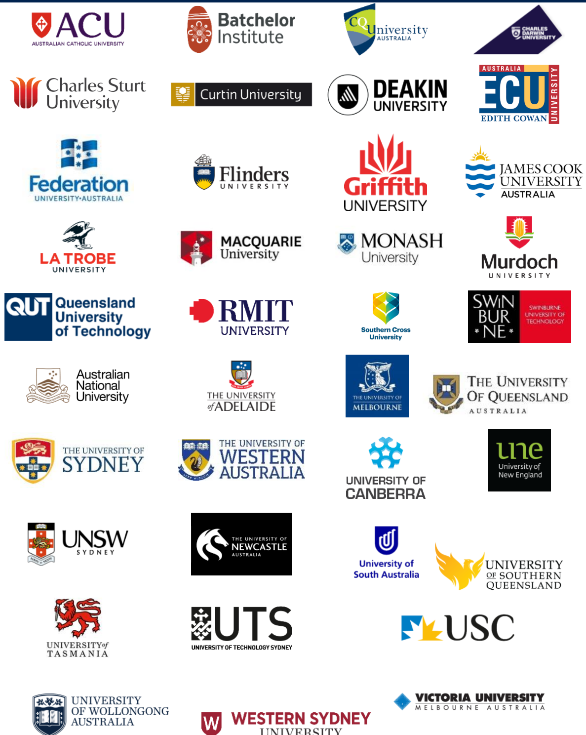
TABLE B PROVIDERS