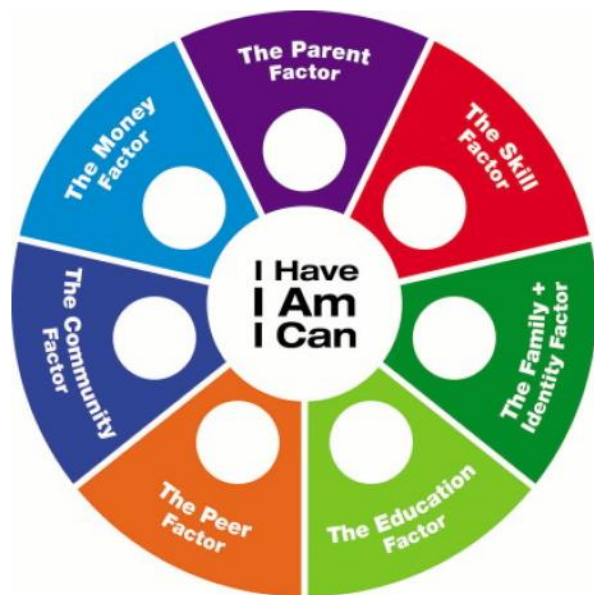
The Resilience Doughnut (image used with permission)